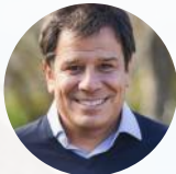
Dr. Facundo Manes

Chamber of Deputies of Argentina, Member