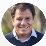
Dr. Facundo Manes

Chamber of Deputies of Argentina, Member