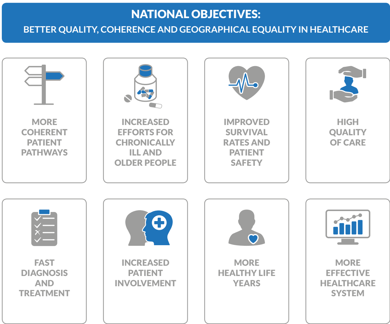
Figure 1. National objectives for healthcare 11