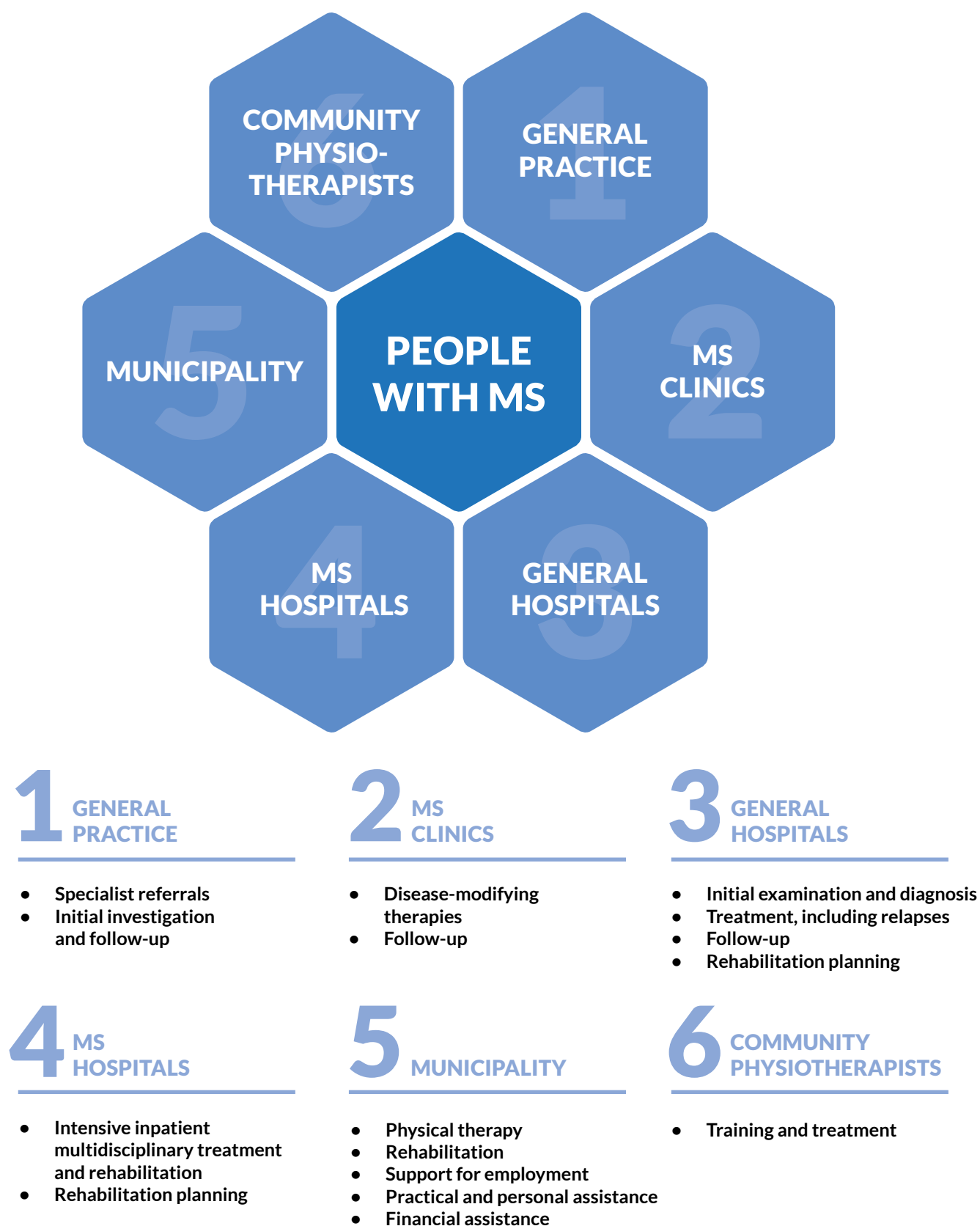
Figure 3. Healthcare providers and interactions associated with MS care in Denmark